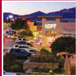
Vintage Oaks