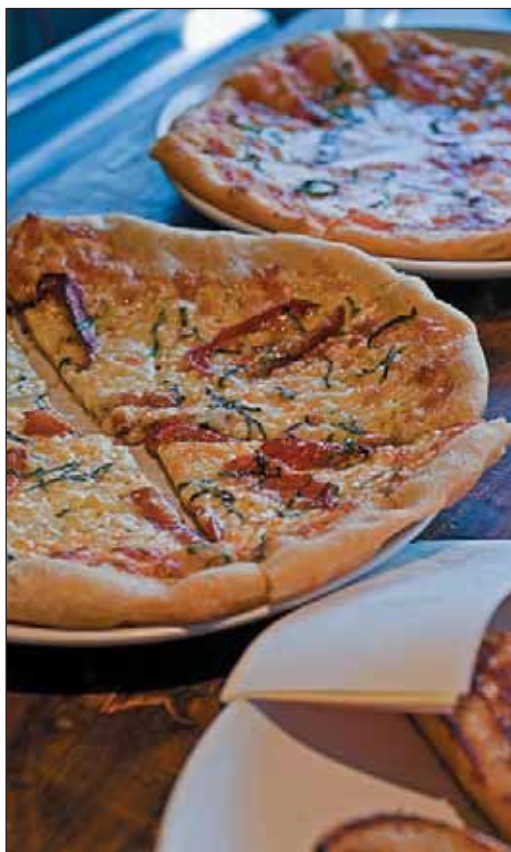
Point Reyes's Osteria Stellina review at pacificsun.com/restaurants .

PIZZERIA PICCO WINE SHOP PIZZERIA Mon-Fri 5-9pm, Sat 12-10pm, Sun 12-9pm. 316 Magnolia Ave., Larkspur. 415/945-8900. www.pizzeriapicco.com $-$$