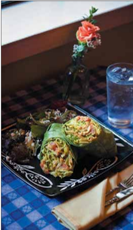
Fairfax's Chad's Grill & Garden Cafe review at pacificsun.com/restaurants.

RICKEY'S RESTAURANT AMERICAN Sun-Thu 5-9pm, Fri/Sat 5-10pm. 250 Entrada Dr., Novato. 415/883-9477. www.rickeyrestaurant.com $$